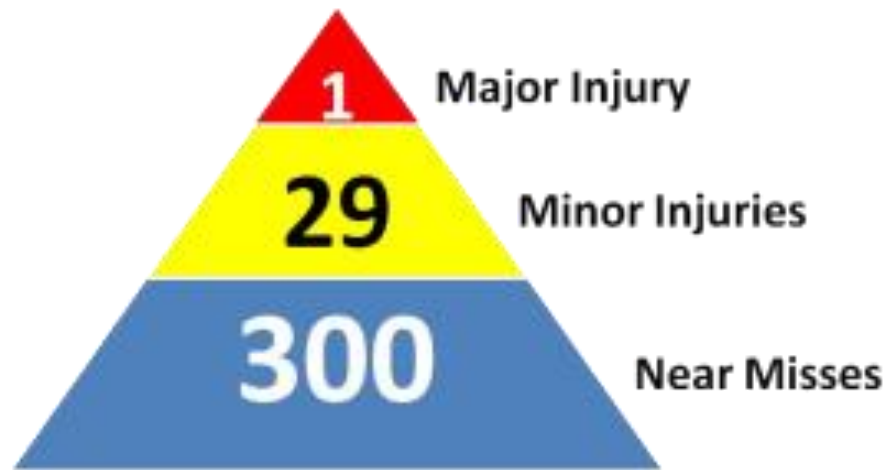
The Heinrich 300-29-1 Model